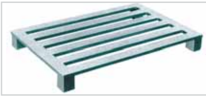
Aluminum 4-way pallet type 520 Pallet deck with 4 longitudinal planks and 4 corner feet

As innovative manufacturer SCHNEIDER LEICHTBAU offers a wide range of different pallets for any possible scope of application – naturally also with the AluClean® surface.