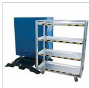
Mobile, variable transporting system