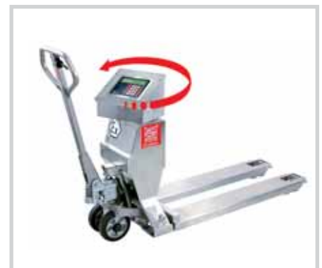
ROBUSTO COMFORT EX SL / VL