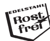
Stainless-steel flat pallet with corner feet Pallet deck with 7 cross planks and 4 corner feet