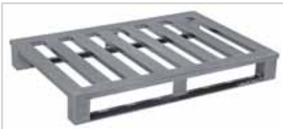
Aluminum pallet, the heavyweight type 512 Pallet deck with 6 cross planks, heavy skid design