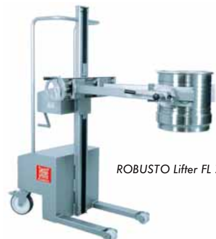
ROBUSTO Lifter FL 70 GBK