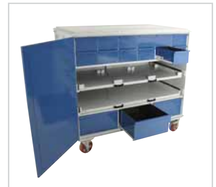
Tool & gear wagon