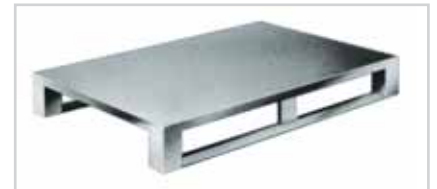
Aluminum full deck pallet, the super hygienic type 512 Pallet deck closed above and below, with longitudinal skids