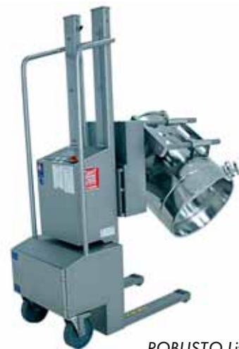
ROBUSTO Lifter FL 120