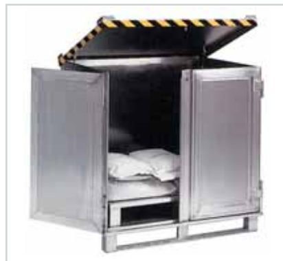
Small container I