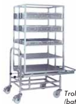
Trolley with roller conveyor (batch trolley)

The casks and models are fit for a practical, appropriate and safe handling of damageable ampoules and bottles. For the automated sterilizing process. Independent of product's shape or geometry, SCHNEIDER engineering develops the optimum product carrier and the perfect product acceptance, for the ideal sterilization process.