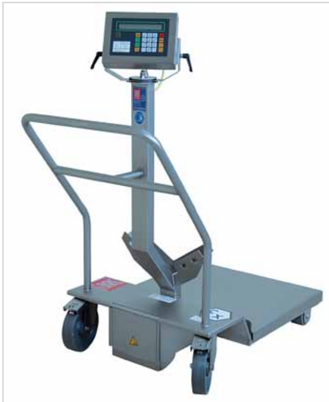
ROBUSTO MW 300 EX

With its highly accurate constructions and technical know-how, SCHNEIDER offers a wide range of weighing solutions.