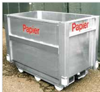
Container with fixed wheels