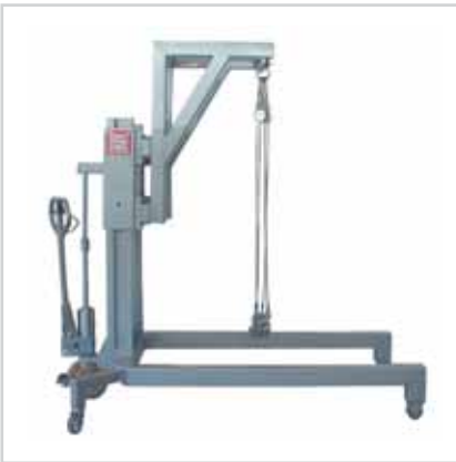
Mobile crane-like gripping arm