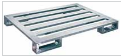
Aluminum flat pallet with short skids Pallet deck with 4 longitudinal planks and 4 short skids 300 mm long