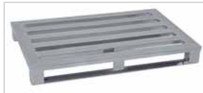
Aluminum pallet, the heavyweight type 512R Pallet deck with 4 longitudinal planks, heavy skid design