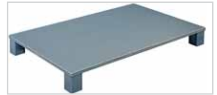
Aluminum full-deck pallet type 520 Pallet deck closed above and below, with 4 corner feet