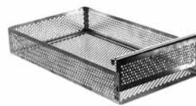
Ampoule cassette with slide