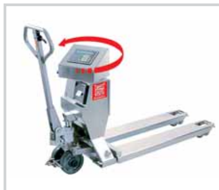
ROBUSTO COMFORT SL / VL