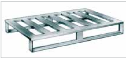
Aluminum flat pallet – the classic type 816 Pallet deck with 5 cross planks, light skid design