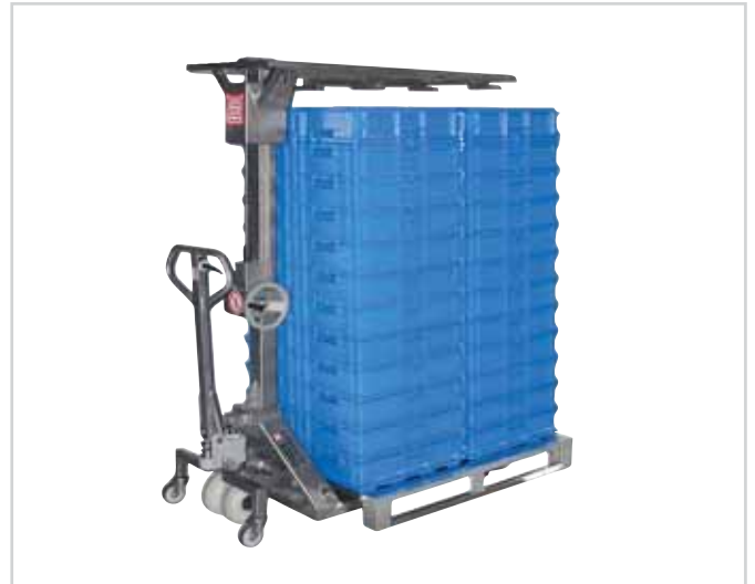
Special design fork-lift truck