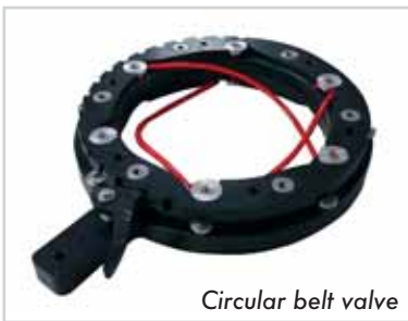
Circular belt valve

Easy dosing due to valve controlling with integrated emptying system, full cleanout by avoiding the formation of wrinkles.