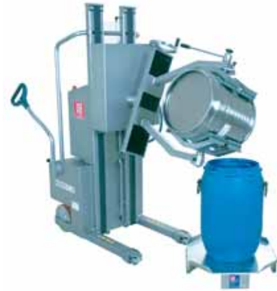
ROBUSTO FL 120 E D GBK