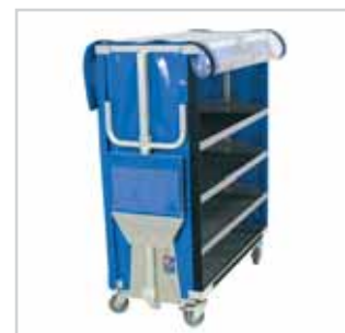
Multi-level wagon-conversion system