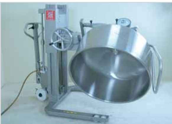
Special lifter, pneumatic with manual, lateral tilting device and 2 arbors