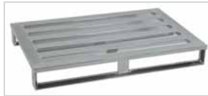
Aluminum flat pallet type 816R Pallet deck with 4 longitudinal planks, light skid design