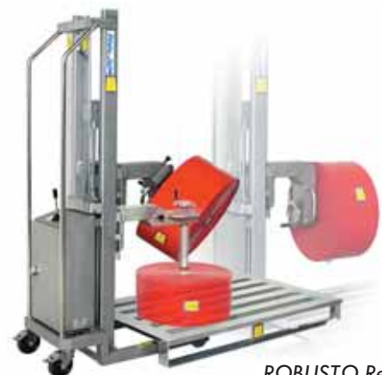
ROBUSTO Reflex 125 V