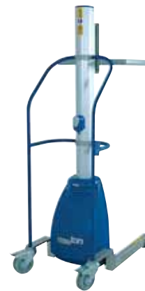
ROBUSTO Newton 250