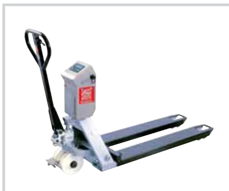
ROBUSTO PRIMA SL / VL

For more information on our different models, please ask for our "Mobile weighing technology" brochure.