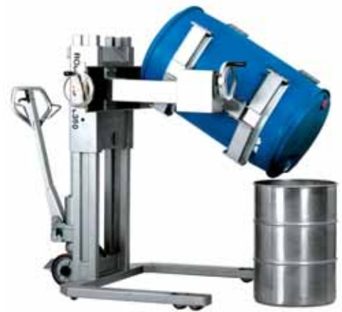
ROBUSTO FL 350 GBK