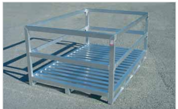
Aluminum box with skids