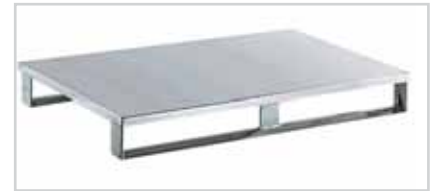
Aluminum full-deck pallet type 816 Pallet deck closed above and below, with longitudinal skids