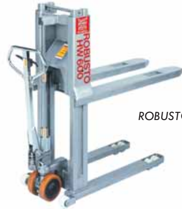
ROBUSTO HHW 600