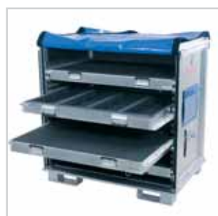
Container with tarpaulin GK 22