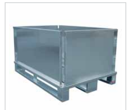
Foldable and stackable frame