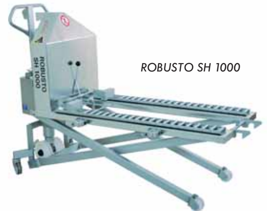
ROBUSTO SH 1000