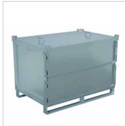
Container for use in pharmaceutical industry